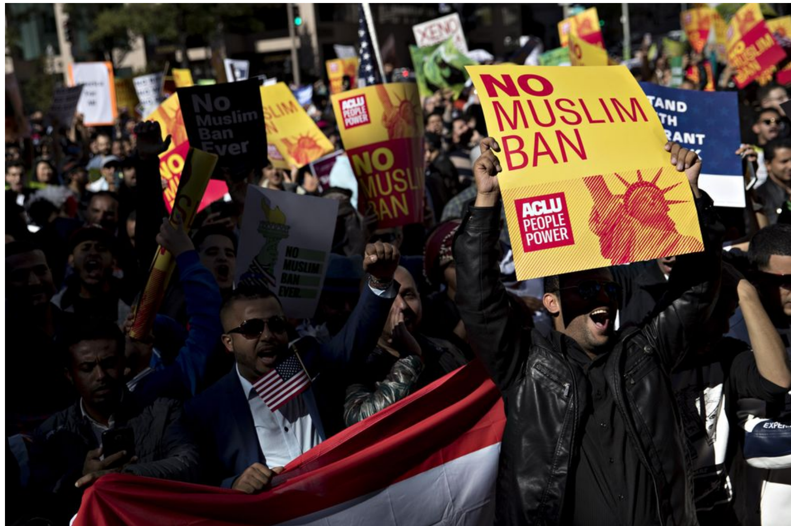
Demonstrators hold "No Muslim Ban" signs while cheering near the Trump International Hotel during a protest in Washington, D.C. on Oct. 18, 2017.

The Trump administration used a bogus terrorism study to prop up its anti-immigrant agenda by claiming most offenses are committed by foreign nationals, a pair of advocacy groups claim in a lawsuit.